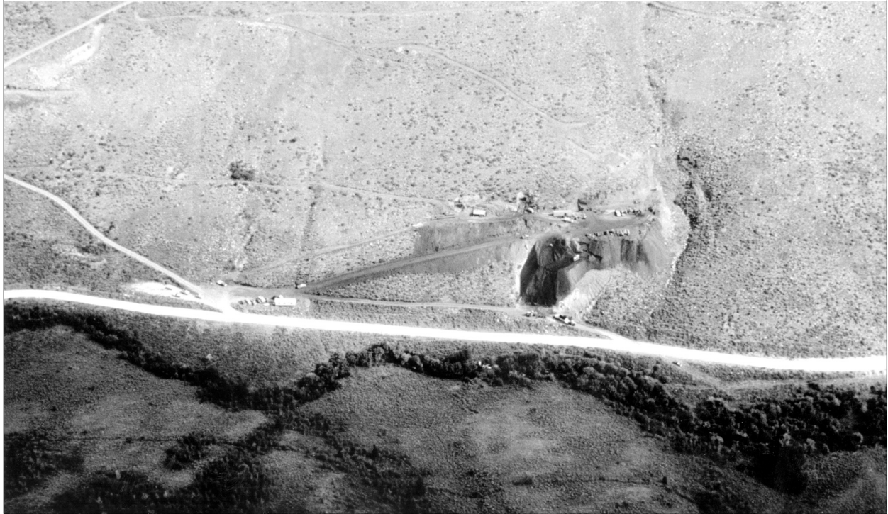
Figure 164. Bloomington Canyon Mine, view north, August 12, 1975.

tunnel (Figure 165). Figure 166 shows a plot of the T14S incline, the 1974 tunnel, and the 1975 tunnel. The purpose of the 1975 tunnel was to prove the success of a continuous mining machine in excavating phosphate ore, to provide bulk samples and to determine existing mining conditions in the phosphate rock. The vanadiferous phosphate ore mined in 1973-1974 and in 1975, was shipped to a processing plant in Wyoming. Gulbrandsen and Krier (1980) reported that ESI's underground work in Bloomington Canyon had created new interest in large-scale underground operations in the phosphate field.