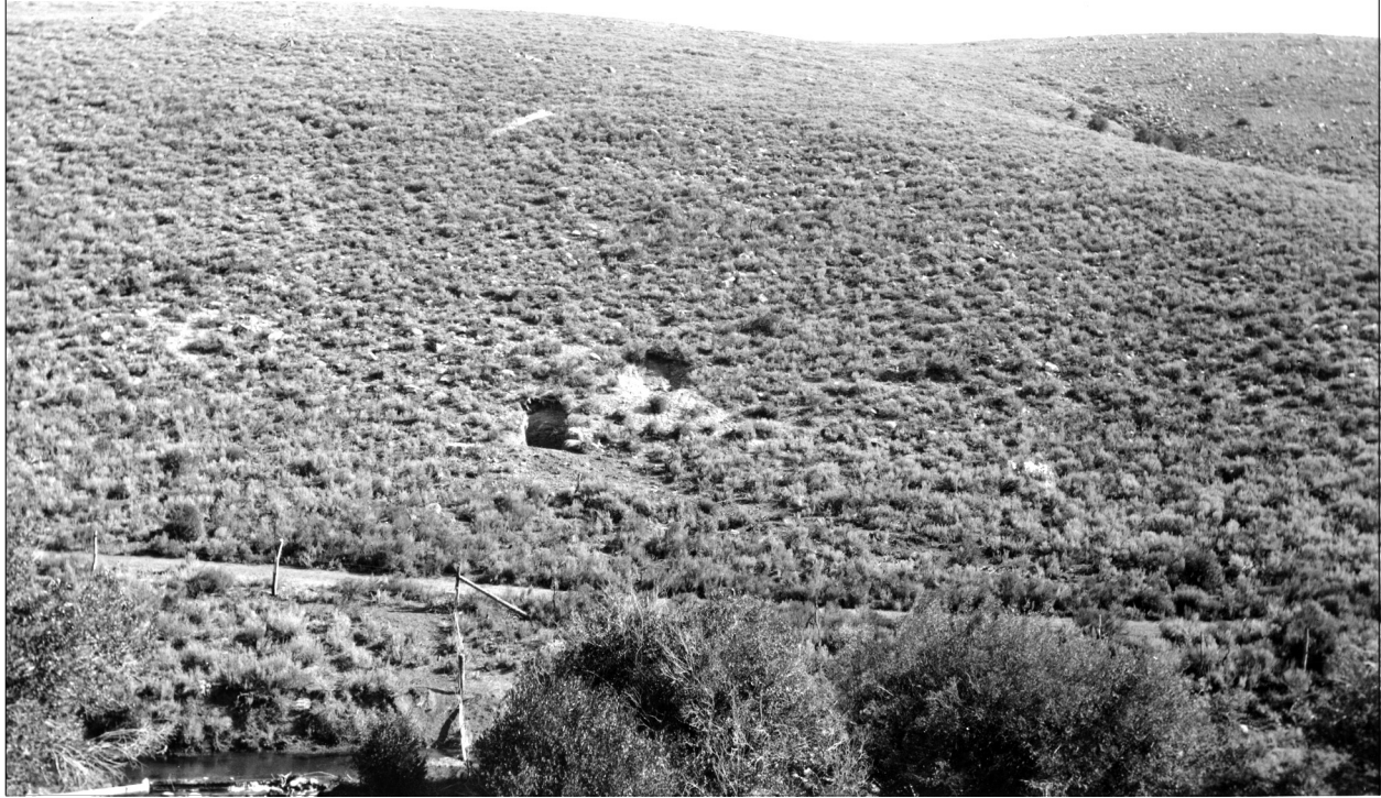
Figure 163. Phosphate prospects on north side of Bloomington Canyon, date unknown.

After the Wyodak exploration and development, the property remained idle until November 7, 1961 when the Ruby Company (J. R. Simplot Co.) applied for a competitive phosphate lease from the Bureau of Land Management. A phosphate lease sale was held on June 7, 1962 with the Ruby Company as the high bidder. A phosphate lease, I-012982, was issued to the Ruby Company on July 1, 1962 for Lot 4 and the SW \frac{1}{4} SE \frac{1}{4} of Section 21, T. 14 S., R. 43 E. The Ruby Co. did not develop the lease and in 1973, assigned the lease to Earth Sciences, Inc. (ESI).