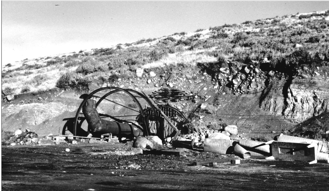
Figure 165. Bloomington Canyon Mine, view north, November, 1978.